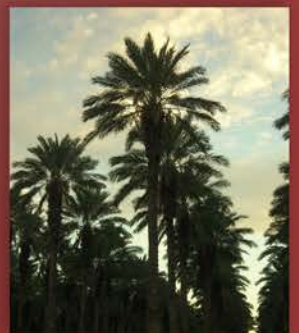
Colorado River Basin