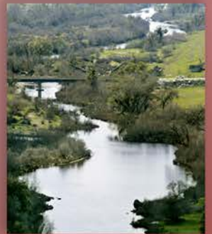
San Joaquin River