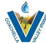
Figure Exported: 6/7/2024, By: mveallarta, Using: \\woodardcurran.net\share\Projects\0011721_13_CVWD_IRWM_Program_Management\FY24\wp102_Protect_Work\06_GIS\ArcGIS Pro\Population.aprx