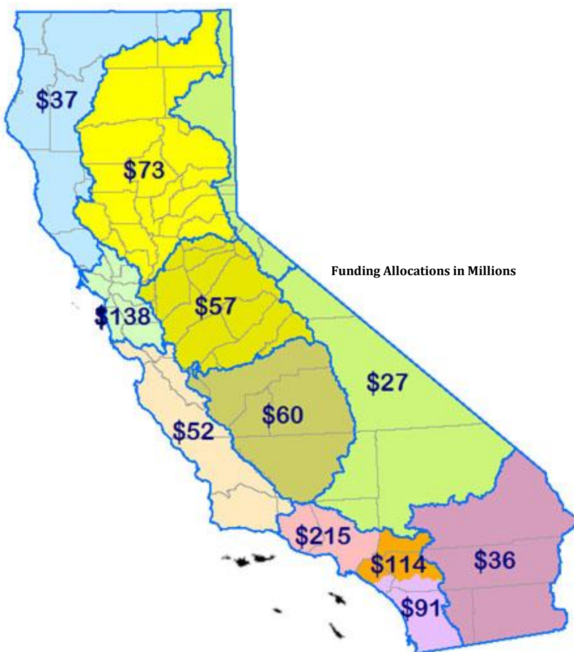
Figure 1 – Proposition 84 Funding Area Allocations

http://bondaccountability.resources.ca.gov/p1e.aspx