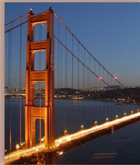
San Francisco Bay Area