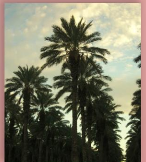
Colorado River Basin